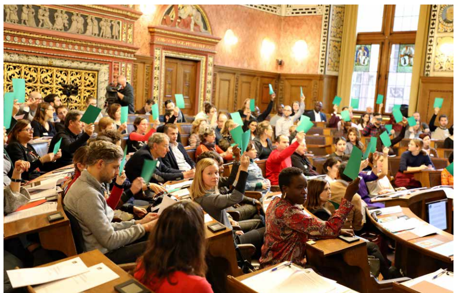
Picture: Migrant*innensession 2019 in Basel, Verein Mitstimme, photo by František Matouš

Citizenship rights have been negotiated and fought for, and consequently have been transformed greatly over time. In