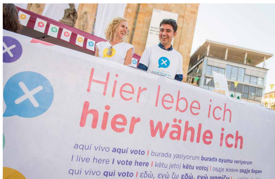
Picture: Campaign Freiburger Wahlkreis 100%

One way of addressing the democratic deficit in terms of voting rights is through local initiatives and collective actions. We found that this concerns not only migrants without voting rights, but that activist groups include people with and without voting rights and with various migration backgrounds. From the perspective of an inclusive society and sustainable democracy, such struggles and their arguments deserve attention both of policy makers and citizens with political rights.