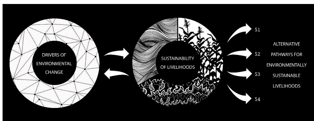
Figure 2. Schematic diagram representing the scenarios process using a water, energy and food nexus approach to explore the sustainability of livelihoods given identified drivers of environmental change.

Once the scoping work was completed, we carried out local community-based workshops for problem framing and pathway theme development using the conceptual framework (see Figure 1) as a guide for the question set and workshop activities. Workshop activities were centred around the participatory mapping of village areas twenty years previous to the present day, identification of changes in land use and land cover over these timescales and evaluation of the impacts of change on water, energy and food security. Attention was paid to social hierarchies and dynamics within local community settings (including social structures such as village leaders and elders, patriarchal roles and expectations, the role that age plays, religious standings and education status), and fieldwork