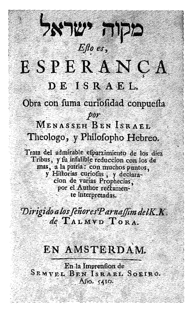
Title Page of Esperanza de Israel by Manasseh ben Israel