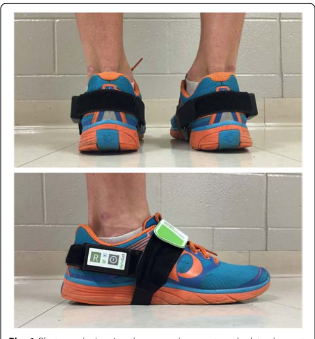
Fig. 1 Photograph showing the senor placement on the lateral aspect of subjects' personal shoes

The instrumented treadmill consists of a treadmill ergometer with an integrated pressure sensor mat comprising a matrix of high-quality capacitive force sensors (range, 1–120 N/cm<sup>2</sup>; precision, 1–120 N/cm<sup>2</sup> ± 5 %) and analysis software. The walking surface of the treadmill (length: 1.5 m; width: 0.5 m) comprises 5378 force sensors. The system measures the dynamic pressure distribution under the feet while walking on the treadmill at a sampling rate of 120 Hz. Spatiotemporal gait characteristics were computed automatically from the pressure data within the software. According to the manufacturer, heel-strike is the time of initial contact (threshold, 1 N/cm<sup>2</sup>) and toe-off the last frame before all