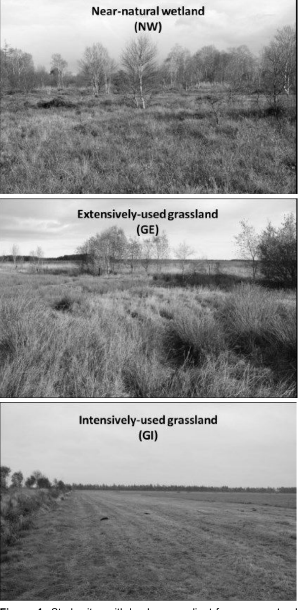
Figure 1: Study sites with land use gradient from near-natural wetland site (no mowing, no fertiliser), extensively-used grassland (cut once per year, no fertiliser) and intensively-used grassland site (cut 4-5 times per year, mineral and organic fertiliser).

Keywords: peatland, carbon loss, land use change, organic soil, land use gradient, grassland use, soil profiles, C balance