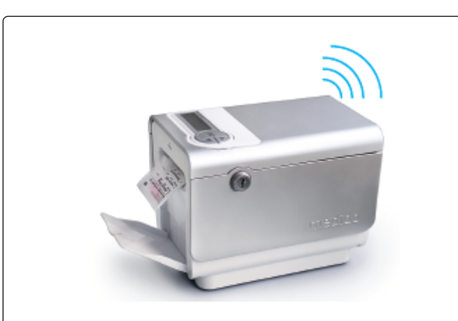
Figure 2: Remote-controlled, electronic medication management aid, medido<sup>°</sup>, used in this study to dispense the unit-of-dose pouches (Height \times Width \times Length: 140 mm \times 140 mm \times 225 mm; Weight: 1.48 g).

A web-based application allows to set the time of dispense individually according to participants' preferences. Pushing the OKbutton stops the alarm and delivers the pouches with the pre-packaged medication. A sensor in the dispenser registers a barcode printed on the top of each pouch and cuts the pouches accordingly. Date and time of delivery are simultaneously transmitted to a secure server with GPRS-technology. Doses can be delivered ahead of schedule (so-called pocket-doses) by pushing the OK-button for 5 seconds. This feature enables patient mobility i.e., to be outside of home during intake times. The dispenser is installed at the patient' home and patient is orally instructed about its proper use. A written manual is given including a telephone hotline number in case of technical problems with the dispenser. A former qualitative analysis of the dispenser suggested that patients with time-sensitive medication regimens could benefit best [14]. Further, a similar type of electronic dispenser has been considered safe to provide OAT [15].