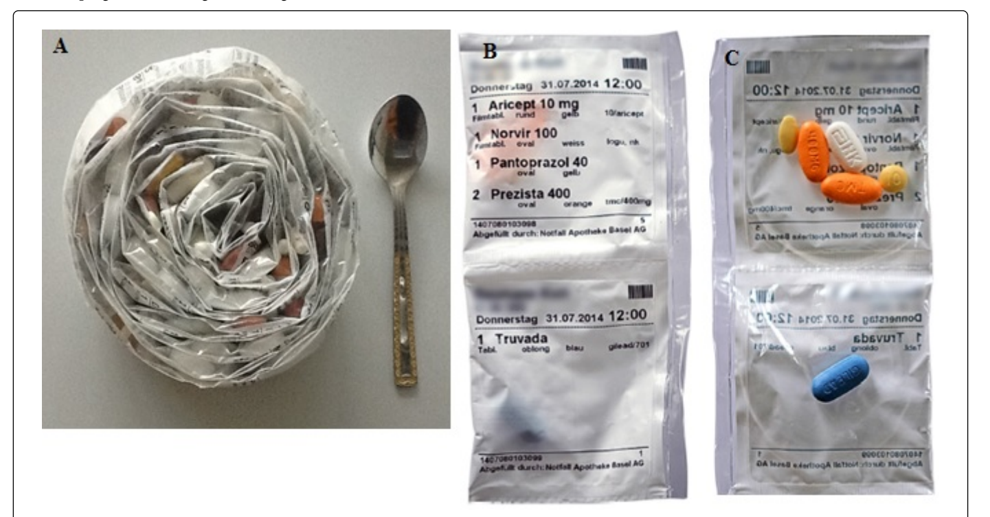
Figure 1: Unit-of-dose pouches with prepacked oral solid medication as roll (A), two pouches from front-side (B) and back-side (C). Note: patient's name and date of birth were concealed for privacy reasons.

Solid oral prescription medications are repacked into unit-of-dose pouches (Automatic Tablet Dispensing and Packaging System, Desk Type JV-30DE, HD-Medi, Germany). Each pouch is imprinted with the patient's data (name, date of birth) and medication data (number, name, date and time for intake, color, shape of the medication; Figure 1).