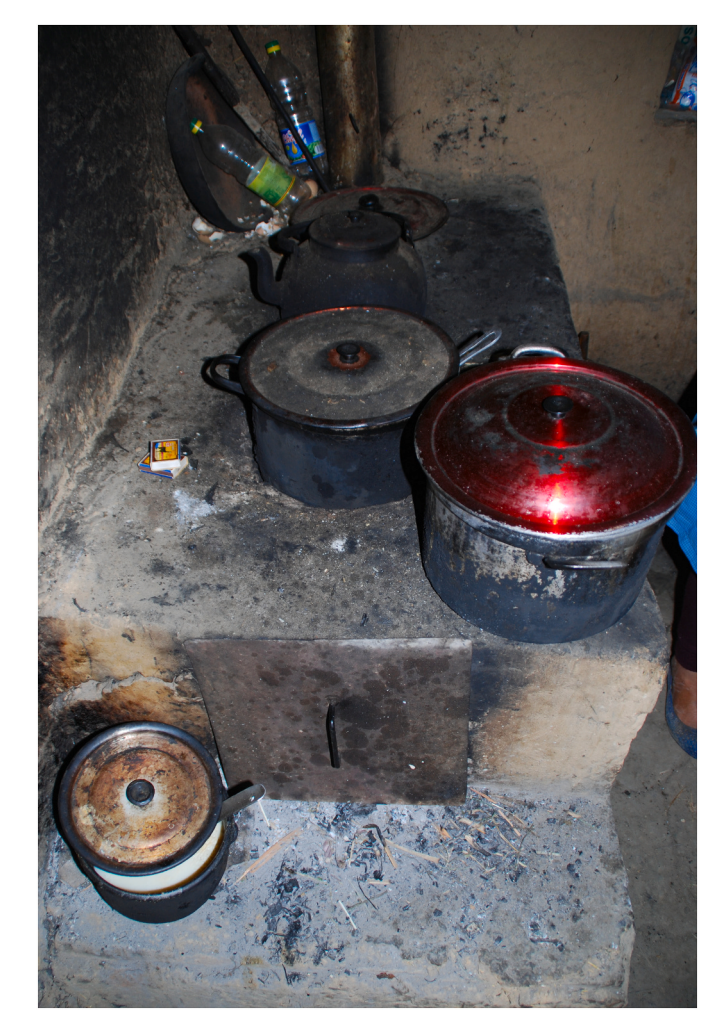
Fig. 3. Example of a 3-furnaces' stove in the rural Peru.

<sup>b</sup> In Cajamarca and La Libertad.