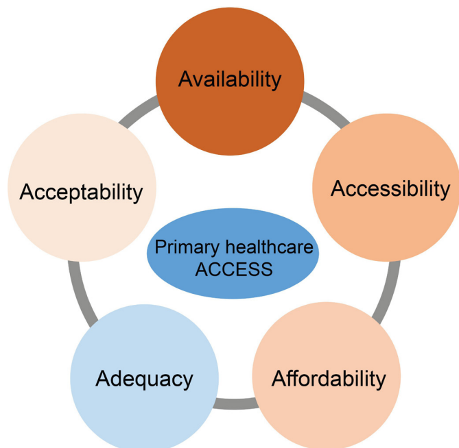
Figure 1 The concept of access: definition and relationship to consumer satisfaction. Adapted from Penchansky and Thomas. 6 Concept of access first elaborated in 1981.

dimensions of the framework are further operationalised by Obrist et al 29 namely: Access, Availability, Affordability, Adequacy and Acceptability (table 1).