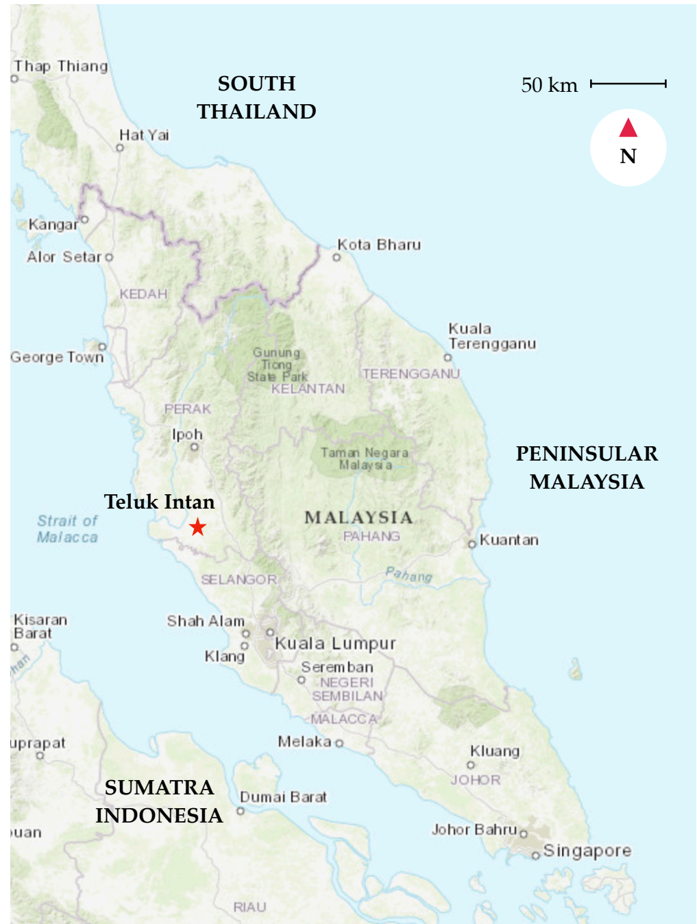
Figure 1. Map of Peninsular Malaysia showing the location of Teluk Intan (red star) within the State of Perak. Accessed on 13 May 2019 from https://landsatlook.usgs.gov/viewer.html .

Analyzer, Beckman Coulter, CA, USA). Assessed biomarkers included C-reactive proteins (CRP) (Immune Quantitative Analyzer) and procalcitonin (PCT) (Procalcitonin Rapid Test Kit, Easy Diagnosis Biomedicine Co., Ltd., Wuhan, China).