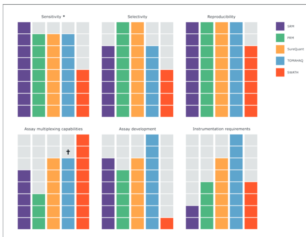
Fig. 2. Relative comparison of different analytical parameters between SRM, PRM, SureQuant, TOMAHAQ and SWATH MS. In the plots, each method is represented by a colored bar according to the analytical parameters. The color of each plot represents the relative magnitude of the variables. A fully coloured bar plot indicates the maximum value for a certain variable in comparison to the other acquisition methods. *Absolute values for most parameters are currently missing, however, LOD/LOQ values for each method are provide in Table 1. †Notably, the sample multiplexing capability of the TOMAHAQ approach provided by the employed TMT quantification is not considered in the assay multiplexing graph.

Enrichment of specific peptides by immunoaffinity purification using antibodies prior to SRM analysis improves the sensitivity and performance of the assay particularly in bodily fluids such as serum and plasma that are predominantly analyzed in clinical laboratories. The Stable Isotope Standards and Capture by Anti-Peptide Antibodies (SISCAPA) workflow enables the enrichment of target and spiked-in heavy reference peptides using