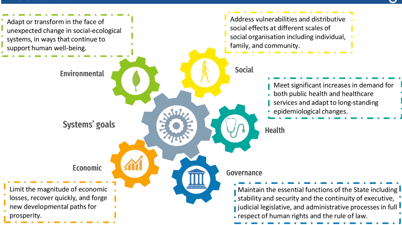
Figure 1 Interconnected societal systems and their different goals in addressing the COVID-19 pandemic.

governance functions and minimising any undesirable systemic effects. This definition encompasses the capacities of societies to (1) prepare, prevent and protect before disruption; (2) mitigate, absorb and adapt during disruptions; and (3) restore, recover and transform after disruption. <sup>6</sup>