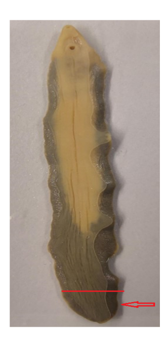
Figure 1. Morphology of an adult Fasciola gigantica fluke. The red line shows the area where the incision of the helminth was performed, and the red arrow indicates the posterior body part that was used for molecular analysis and MALDI-TOF MS.

supernatant discarded. The pellet was resuspended in 50 \mu L of 70% formic acid and 50 \mu L of acetonitrile and mixed by vortexing. Of note, we also employed additional steps, including the use of Zirconium beads, during the development of our helminth extraction protocol, but did not observe differences in the obtained spectral profile. Hence, we decided not to use beads to reduce the working steps and the hands-on time per sample.