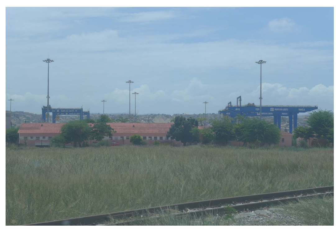
FIGURE 2. The dry port was empty. Photo by Jon Schubert, June 2019.

This dismal state of affairs, interlocutors agreed unanimously, was a result of the crisis a calamity that befell Angola in late 2014, when the price of a barrel of Brent crude oil dropped from about 110 USD to 62 USD, fluctuating between 60 and 35 USD per barrel for most of 2015 through 2017. With oil accounting for 90 percent of exports and 75 percent of government revenue, the country plunged into a deep recession: rising inflation, a steep depreciation of the national currency, the kwanza, and the elimination of subsidies on fuel, hit the poorer parts of the population hardest. And despite a slight, temporary recovery of oil prices in 2018, the crisis has only deepened from 2018 to 2020: the population has no money, and a serious dollar shortage left importers struggling to pay for their goods. Most of my interlocutors estimated that since 2014, the volume of goods imported had dropped between 50 percent and 60 percent.