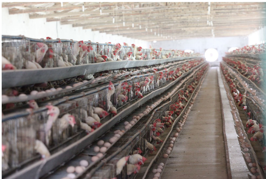
Fig. 2 Intensive and subsistence livestock production are an income source for hundreds of millions of small-holder farmers but also exposing animals and humans to infectious disease

National states are in a normative dilemma of preventing new outbreaks at the cost of economic hardship for millions of small-scale farmers and other economic actors. Governments and experts alone cannot solve this dilemma. All actors having their stakes need to be involved in a societal consensus to jointly enhance biosecurity, without compromising economic activities. What a nation is prepared to engage in the prevention of new outbreaks through better biosecurity has to be negotiated in every context independently. There are no blueprints, but the engagement of academic and non-academic actors in a transdisciplinary process has a high potential to find locally adapted solutions, as recommended by the Organization for Economic Co-operation and Development (OECD) [32]. As evidenced by the COVID-19 pandemic, efforts have to move even beyond