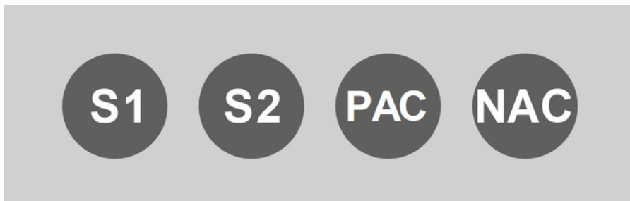
Figure 1: Visualization of the experimental set-up of a ready-to-use B. tabaci LAMP kit described in the protocol. S1, sample 1; S2, sample 2; PAC, positive amplification control; NAC, negative amplification control. Please click here to view a larger version of this figure.

A subset of the assays (N = 13) was performed under on-site conditions at the Swiss POE Zurich Airport by plant health inspectors using the ready-to-use B. tabaci LAMP kits 8 . When cross-validated in the reference laboratory, all results from on-site testing were found to be correct (test efficiency = 100%) 8 . Assessing the on-site LAMP assay performance, the average time to positive (time until a positive results was available) was 38.4 \pm 10.3 min (mean \pm standard deviation) 8 . A representative DNA amplification plot and the corresponding annealing derivative from a B. tabaci LAMP analysis performed under on-site conditions are shown in Figure 3A and B . In this example, sample one and two were correctly identified as B. tabaci indicated by DNA amplification after approximately 30 min ( Figure 3A ) together with the expected annealing temperatures at approximately 82 °C ( Figure 3B ).