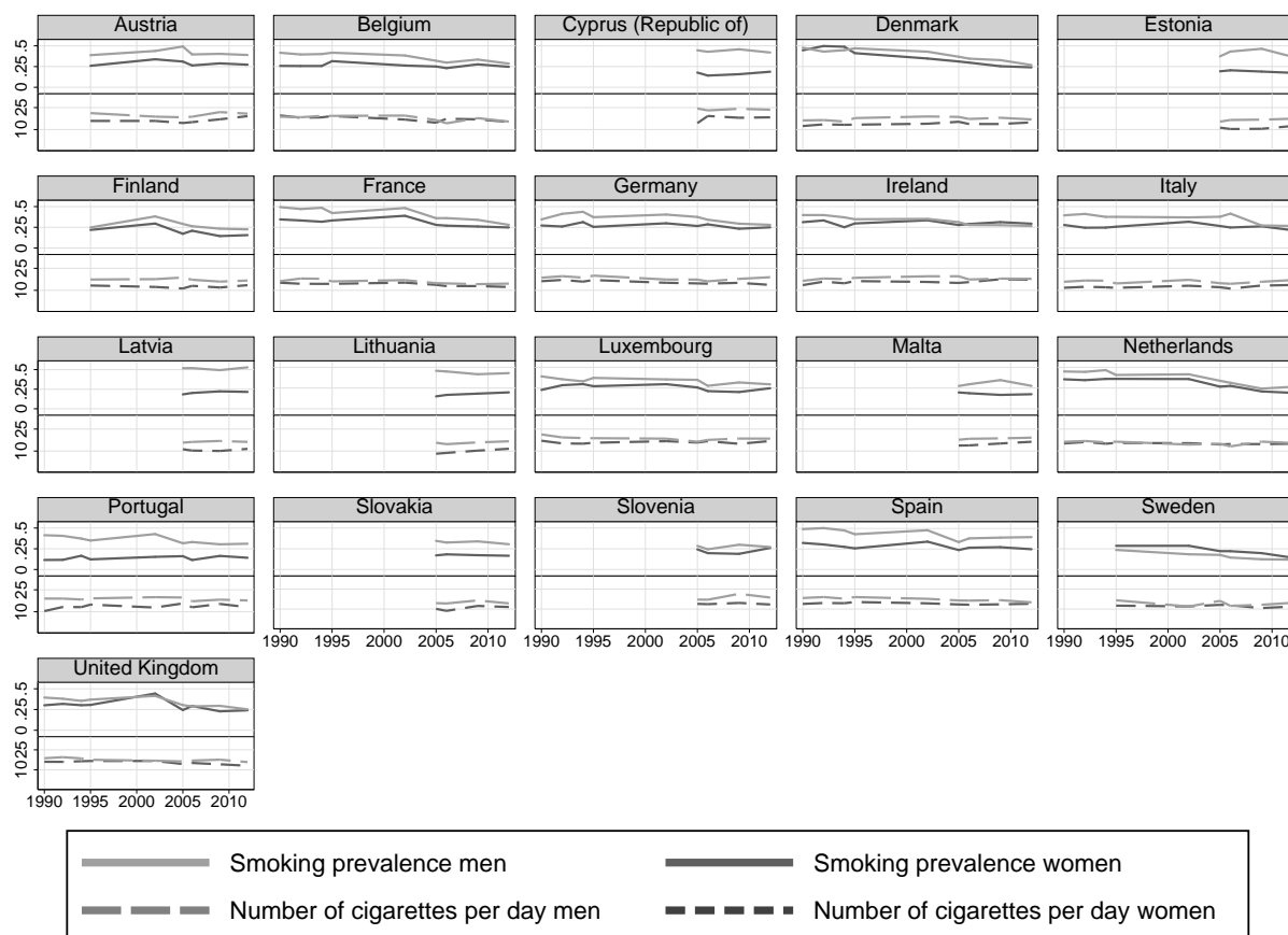
Figure 1: Smoking prevalence and average daily cigarette consumption among smokers, 1990-2012

Data source: Eurobarometer survey series.