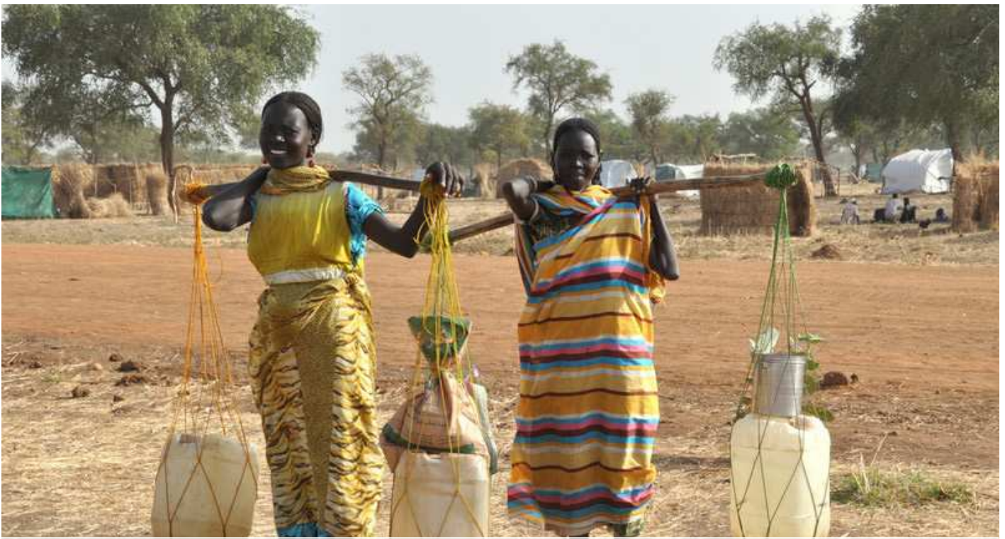
Women carrying water in South Sudan.

Another source of legitimacy was ethnicity, on the basis of which leaders mobilised military and political support. This was a particularly useful resource during competition for political office, particularly during elections and also during conflict. Ethnicity has been very important, as the sense of nationhood is fragile. The downside is that ethnicity is behind violence in the country as leaders often mobilise their groups along ethnic lines against others, as is evident in the ongoing armed conflict.