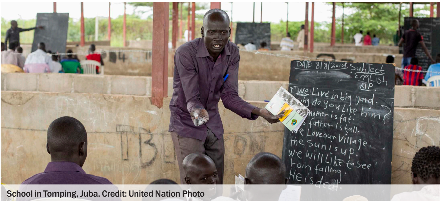
School in Topping, Juba.

While it is true that the South Sudanese state was born only a few years ago, after years of violence and destruction, the institutions of the country were not established from scratch in 2005 or in 2011. As mentioned above, the SPLM formed institutions from the time of the 1994 Chukudum Convention, and the international community supported their development. The leaders of South Sudan have not had the political will nor the means to develop fully functioning and effective institutions that can address major challenges and also check the monopolisation of power by certain individuals and branches of government. The narrative of 'youngness' is a mask for something else, including the unwillingness of leaders to embrace change, which would take more than resources to correct. A religious leader lamented that: 'this child is crazy as it does not grow and is always on emergency.' 10