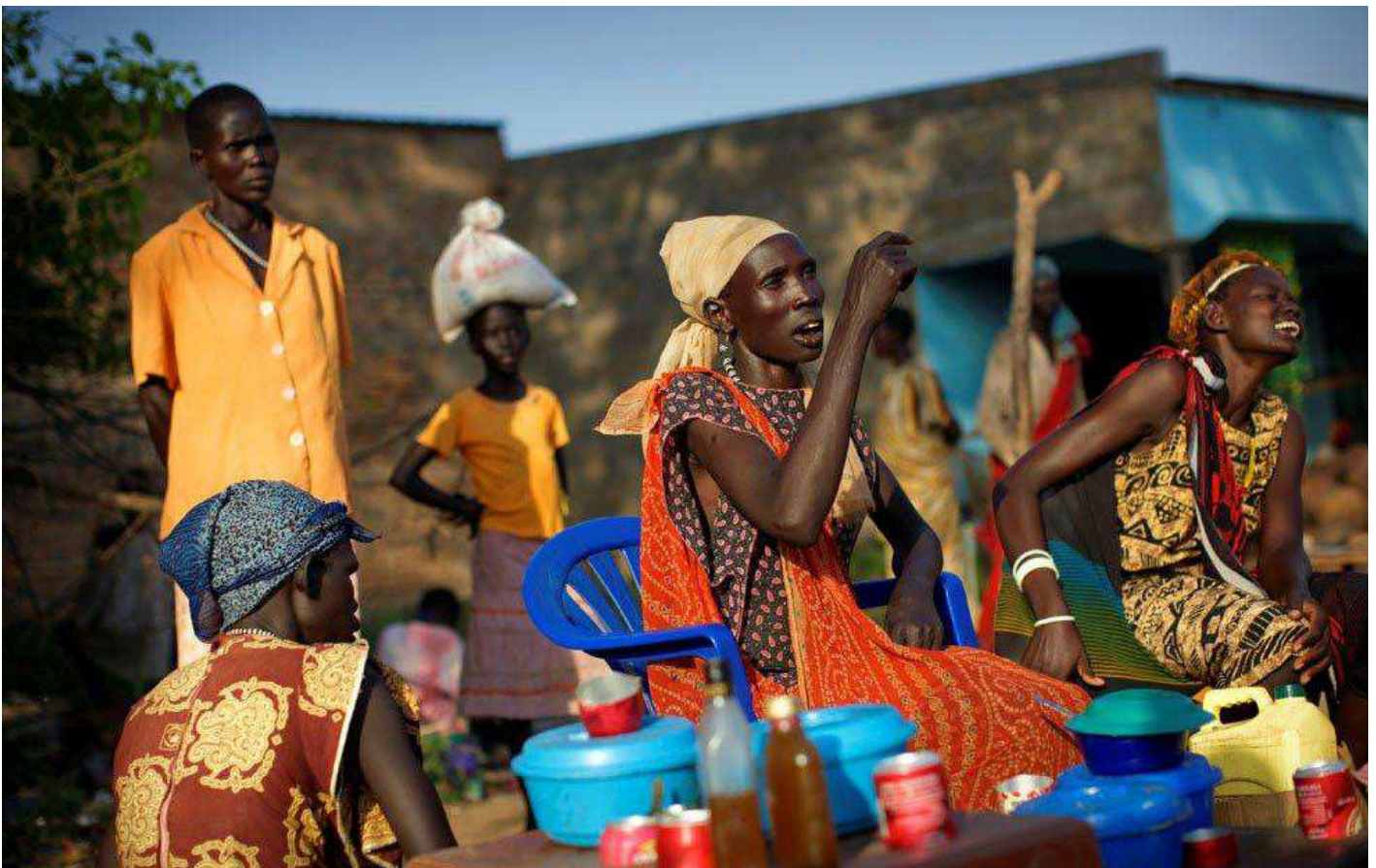
Women in a market in Lakes state.

The next section explores the literature on legitimacy, focusing on its sources in conflict and post-conflict settings. Section 3 covers the armed rebellion from 1983 to 2005, analysing the ideas and ideologies that the SPLM/A leaders adopted to mobilise support and examining processes and motivations for the development of governance structures and perceptions of these processes and practices. Section 4 traces continuities in governance practices into the post-CPA period and also examines sources of legitimacy from that time. The last section concludes.