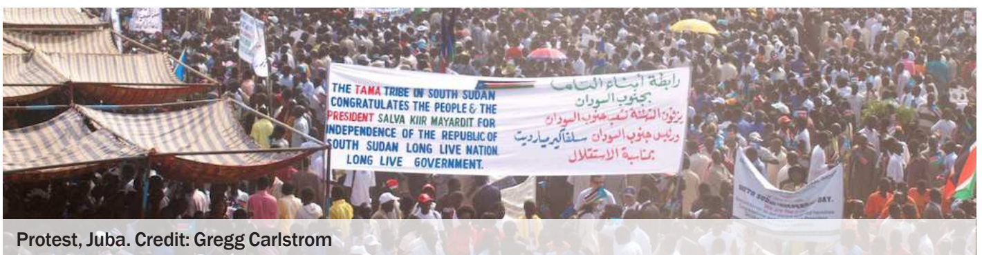
Protest, Juba.

Gradually, debates on statebuilding have begun to take on a more nuanced approach. For example, the Organization for Economic Co-operation and Development (OECD) pointed out in a 2011 report that: 'statebuilding is a deeply political process, and understanding the context – especially what is perceived as legitimate in a specific context – is crucial if international support is to be useful' (OECD DAC 2012: 11). Despite the changing debate, however, statebuilding in practice continues to be informed by models of liberal democracy and neoliberal economic practices, and is still dominated by technical approaches and externally driven (Roberts 2008). In the case of South Sudan, critics have observed that, starting from 2005, donors and other international actors have largely focused their efforts on technical activities. Their engagement has been largely ahistorical and apolitical, and hence has neglected the political tensions among key players in South Sudan that boiled over into war in 2013 (Pantuliano 2014).