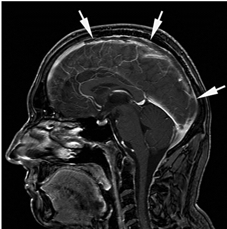
Fig. 1. Cerebral sinus venous thrombosis in the superior sagittal sinus.

We thank the patients for allowing their case and accompanying images to be published.