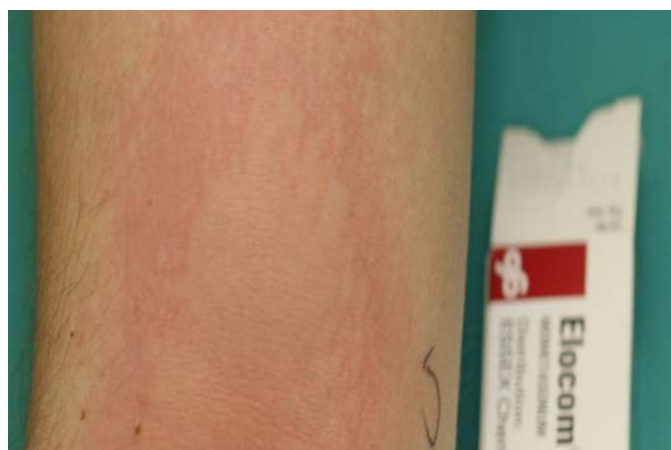
Fig. 1. Contact urticaria 20 min after open application of Elocom ® ointment containing hexylene glycol.