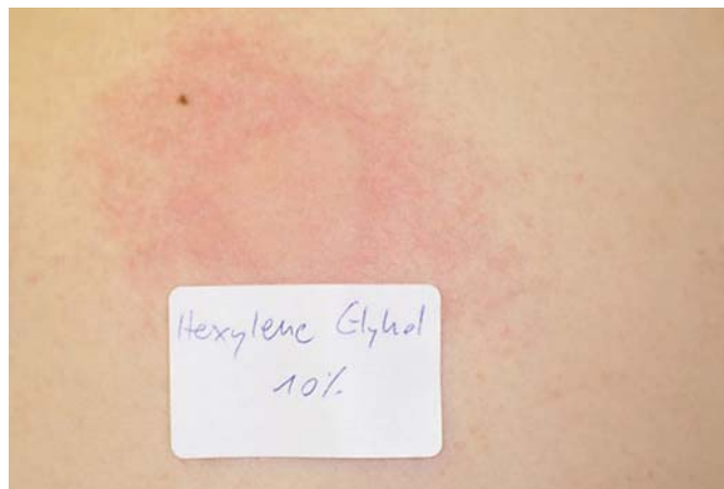
Fig. 2. Contact urticaria after application of hexylene glycol 10%.

type. Immunologic contact urticaria reactions may typically spread beyond the site of contact and progress to generalized urticaria. If more severe, immunologic contact urticaria may lead to anaphylactic shock. One such example is immunologic contact urticaria from natural rubber latex.