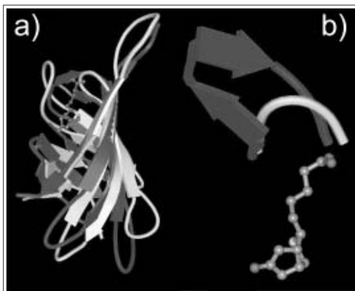
Fig. a) Superposition of avidin (light) and streptavidin (dark) monomers emphasizing their structural similarity; b) Zoom on the 5-6 loop (Biotin: ball and stick).